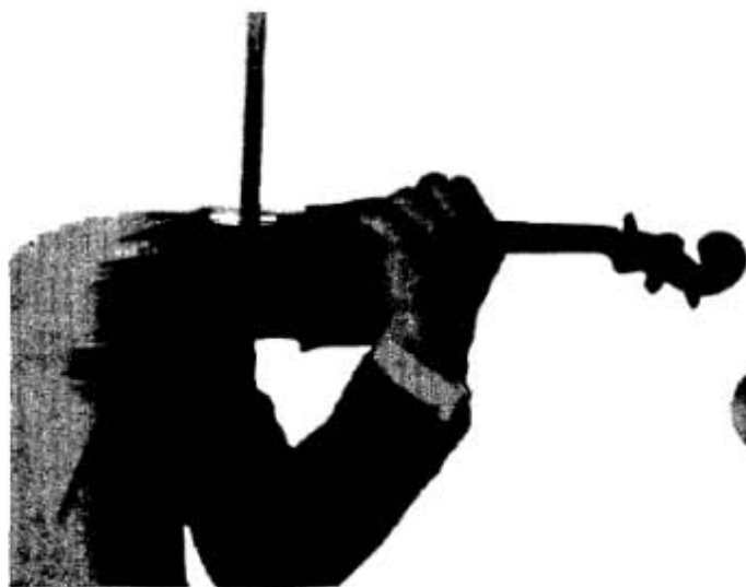
SIXTH POSITION (Front View)

Déjese que el primer dedo se mantenga en posición lo más posible, como soporte á una correcta afinación. El más alto asciende en el diapasón, el más cerca viene hacia el puente, y el pequeño afirma las paradas. Los medios tonos en esa posición deben hacerse muy pegados de uno al otro.