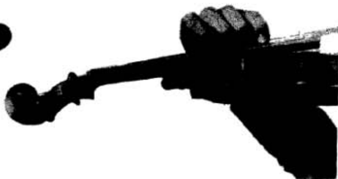
SIXTH POSITION (Rear View)